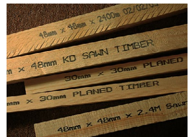
Direct applied to building materials