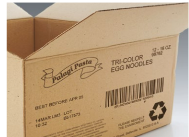
High-resolution text, bar codes and logos on shipping cases