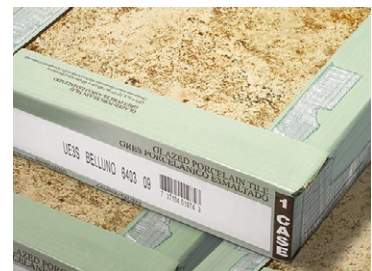
POS packaging for oversized items