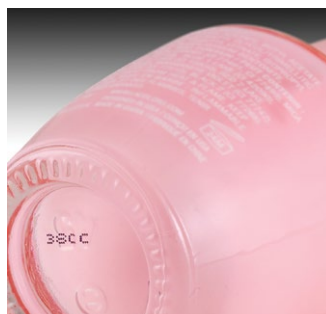
Cosmetics – glass