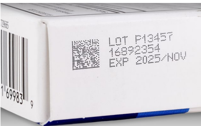
Pharmaceutical — paperboard