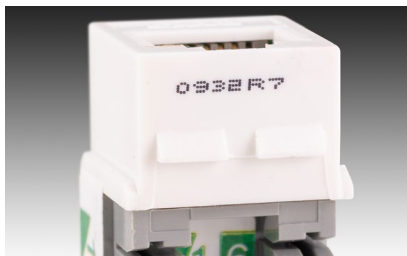
Electronics — plastic