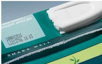
Beverage — coated cardboard