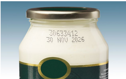
Food — glass