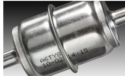
Small parts marking — metal