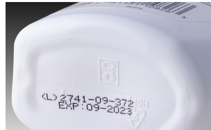
Personal care — HDPE plastic