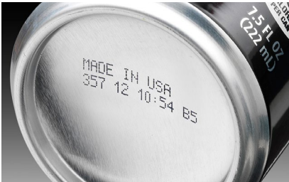
Beverage — metal