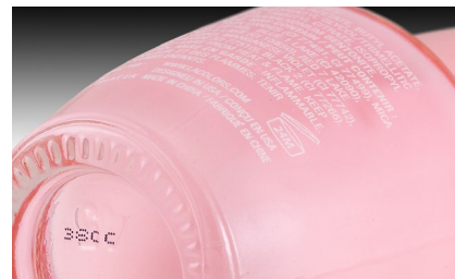
Cosmetics — glass

Get a choice of built-in Wi-Fi or cellular connectivity